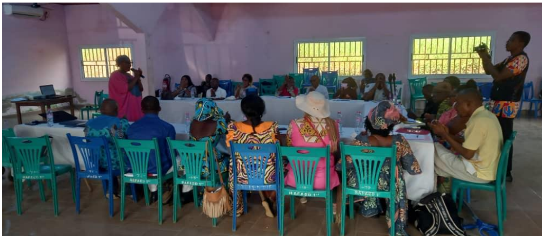
Becoming aware of GBV in all our living environments