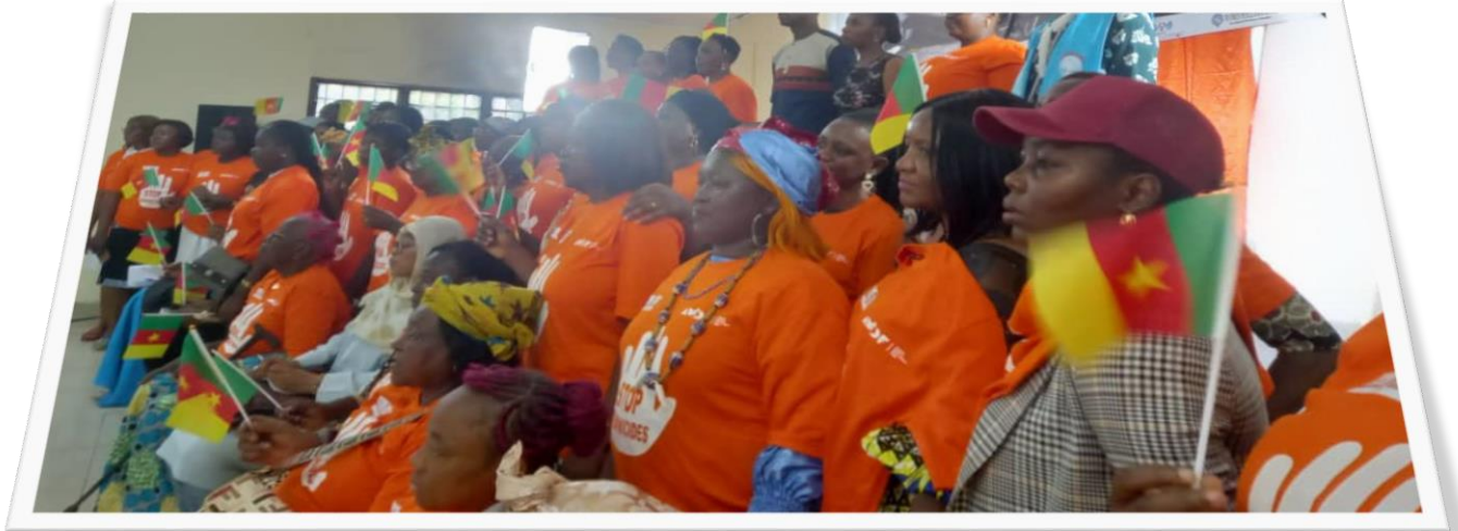
Family photos on the occasion of the collaborative advocacy