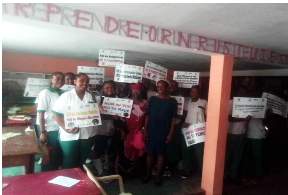
College of Laureates: International Day of the Girl Child 2024