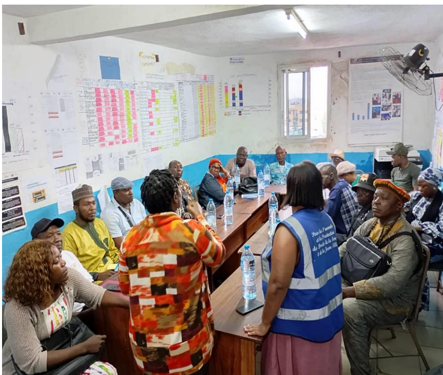
Horizons Women Douala 3 Headquarters

This meeting with the main objective of presenting the CoSMO project and the actions on the prevention and management of violence against children.